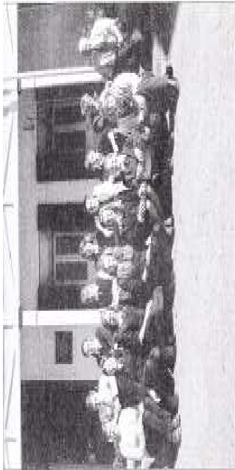
LEARNING CURVE: Dutch exchange students and teachers take well-earned breaks with Delaware's poor during a long and fruitful day.